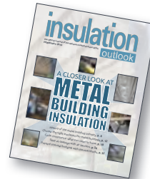
February 2016 Issue A Spotlight on Metal Building Insulation

Advertising Materials Due December 22, 2016