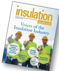
April/May 2016 Issue Double Issue: The State of the Industry

Advertising Materials Due February 22, 2017