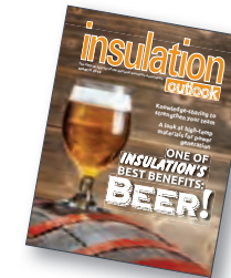
March 2016 Issue Engineering Insulation Systems

Advertising Materials Due January 22, 2017