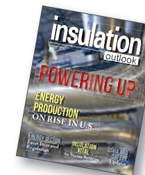
August 2016 Issue Power and Energy Issues