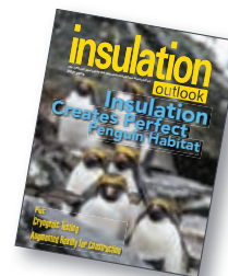
July 2016 Issue Cryogenic and Liquefied Natural Gas (LNG) Systems