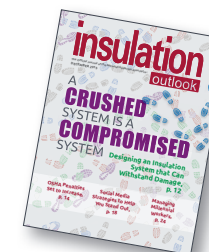
December 2015 Issue Insulation Systems

Advertising Materials Due October 23, 2017