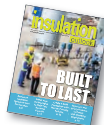
November 2015 Issue Built to Last

Advertising Materials Due September 22, 2017