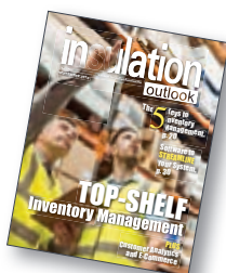
September 2016 Issue Product Supply Chain and Inventory Management