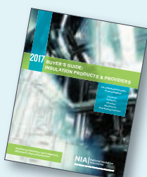
2017 Buyer's Guide

Please send your press releases about your company, new products, and insulation-related news to editor@insulation.org for possible complimentary publication in Insulation Outlook . The bonus distribution will be scheduled at time of publication. Contact your advertising sales representative for the latest information.