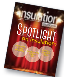
June 2016 Issue Spotlight on Insulation

Advertising Materials Due April 24, 2017