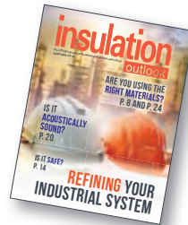
January 2016 Issue Industrial and Refractory Systems

Advertising Materials Due December 12, 2016