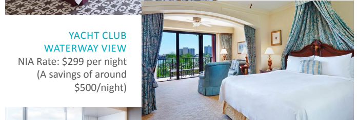
YACHT CLUB WATERWAY VIEW NIA Rate: $299 per night (A savings of around $500/night)