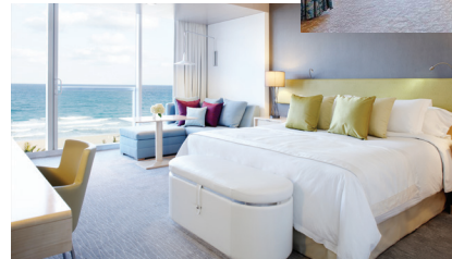
BOCA BEACH CLUB, OCEAN VISTA ROOM NIA Rate: $319 per night (A savings of around $175/night) Located at the Beach Club, a few minutes by shuttle or ferry from the main resort.

All room types have limited quantities. Rates include the resort fee (a savings of $27 per night), and are based on single or double occupancy, plus state and local taxes. NIA's discounted hotel rates are available before and after Convention from April 15–25, 2016 based on availability. You must be a registered NIA Convention attendee to qualify for this discount.